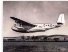
Fly Vaal Marina

The mountain bike and bmx track has also had no response so far, I guess it is not what is wanted. The big question is "What do you want" and is it achievable with the limited resources we have?