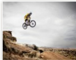
Mountain Bike track